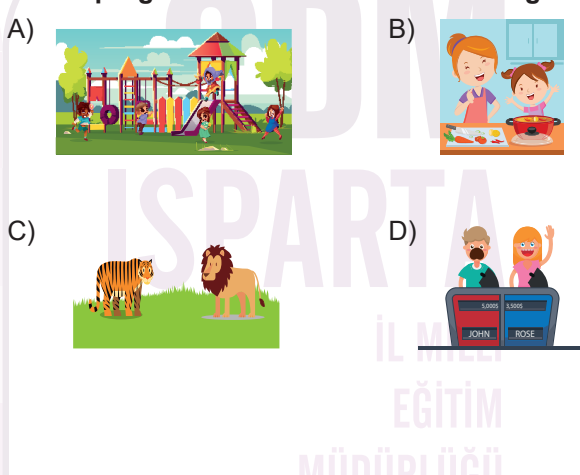
8. Which programme did Jane watch last night?

shows. I also watch children's programmes and sitcoms, but I never watch talk shows or cookery programmes. I think they are boring. I don't usually watch documentaries, but I watched a documentary last night with my father. There were many things about wild life in it. It was great.